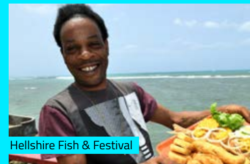
Hellshire Fish & Festival