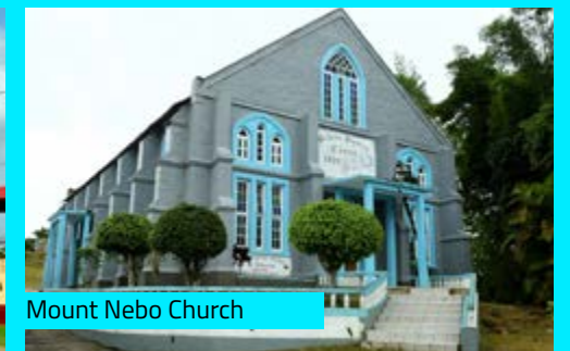
Mount Nebo Church