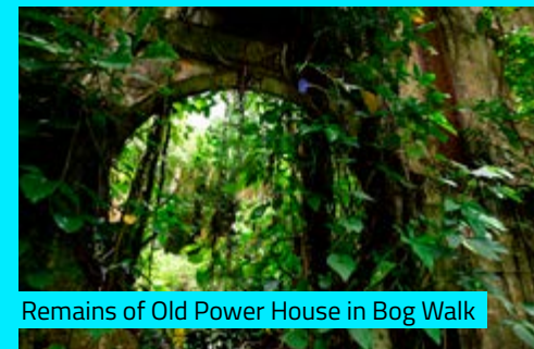
Remains of Old Power House in Bog Walk