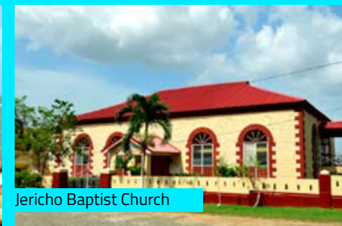
Jericho Baptist Church