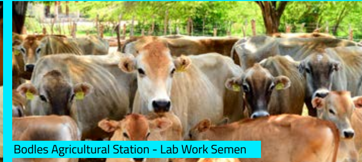
Bodles Agricultural Station - Lab Work Semen