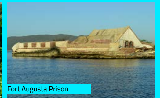
Fort Augusta Prison