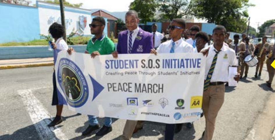
Student members of the SOS Initiative marching in the crowd for the peace march under the theme ‘Students’ Safety Our Priority took students of St George’s College, Wolmer’s Boys and Girls, Kingston College, Convent of Mercy (Alpha), Camperdown High, Holy Trinity, Kingston Technical and Kingston High travelling on Wildman, Sutton, Beeston, Duke and North streets to end at St George’s College.